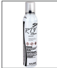
RTV™ Silicone Adhesive/Sealant/ Caulk/Gasket Marker