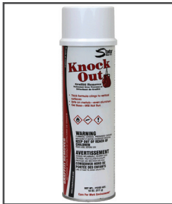
Knock Out™ Aerosol Graffiti and Soil Remover