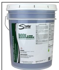
Ecolution® Drain Line Maintainer Bacterial Lift Station Maintainer