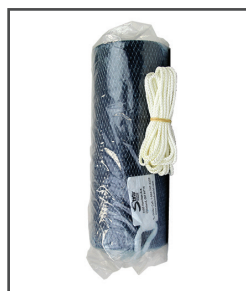
Block Worx™ BCT Time Release Bacteria Block