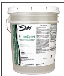
PrimeZyme™ Liquid Bacterial Enzyme Treatment