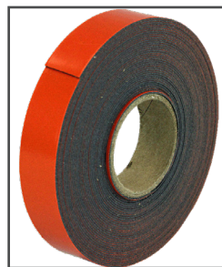
Make-A-Bond™ Double-Sided Adhesive