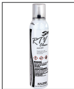
RTV™ Silicone Adhesive/Sealant/ Caulk/Gasket Marker