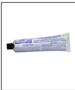
Formuflex® Clear Adhesive/Sealant with Ultra Violet Inhibitor