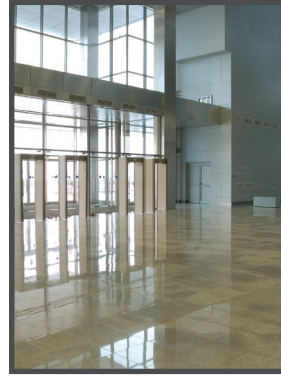
Government and Municipal Buildings