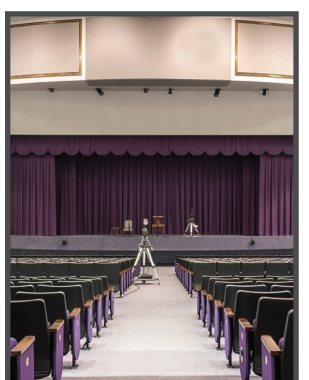
Event and Convention/ Hotels Conference Centers