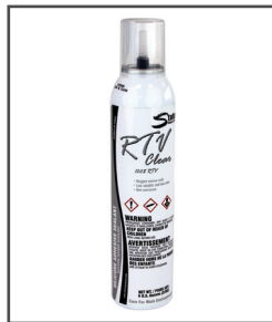
RTV™ Silicone Adhesive/Sealant/ Caulk/Gasket Marker