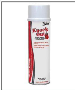
Knock Out™ Aerosol Graffiti and Soil Remover