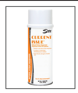
Current Issue® Parts Washing Solvent