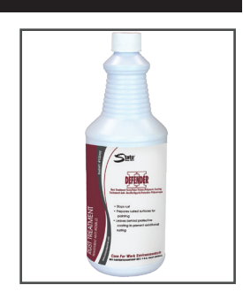
Defender® II Rust Treatment, Paint Primer, Polymeric Coating