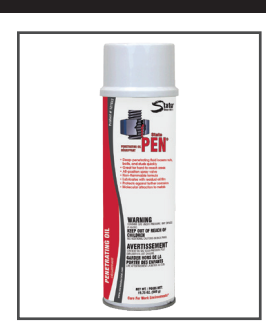
State® PEN® Aerosol Penetrating Fluid