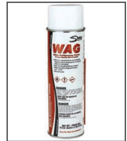
WAG™ Food Grade Lubricant