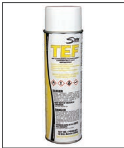
TEF™ Dry Teflon Aerosol Lubricant