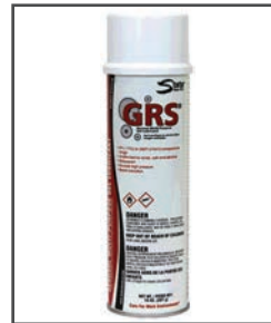
GRS® Multipurpose Red Lubricant