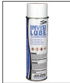
Invisilube® Heavy-Duty Clear Aerosol Grease