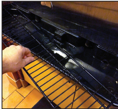
Remove beverage tray top