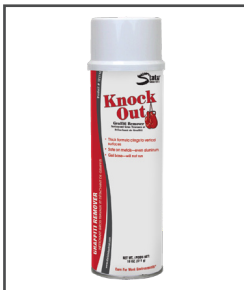
Knock Out™ Aerosol Graffiti and Soil Remover