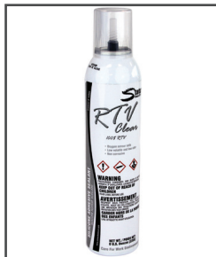
RTV™ Silicone Adhesive/Sealant/ Caulk/Gasket Marker