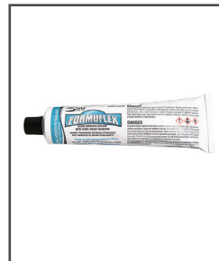
Formuflex® Clear Adhesive/Sealant with Ultra Violet Inhibitor