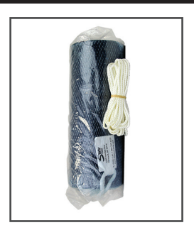
Block Worx™ BCT Time-Release Bacteria Block