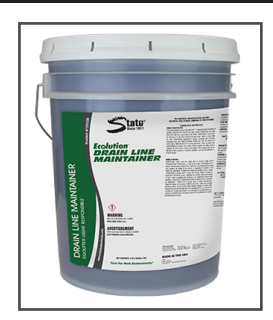
Ecolution® Drain Line Maintainer Bacterial Lift Station Maintainer