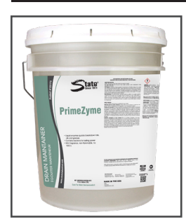
PrimeZyme <sup>™</sup> Liquid Bacterial Enzyme Treatment