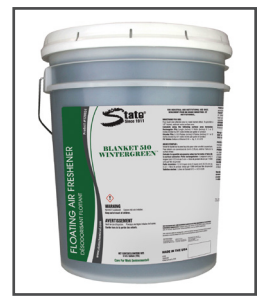
Blanket 510 Wintergreen™ Floating Air Freshner