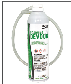
Foaming Devour™ Foaming Drain Maintainer