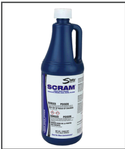
SCRAM® Sulfuric Acid Drain Opener