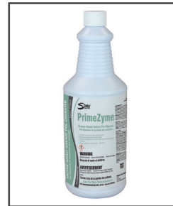
PrimeZyme™ Liquid Bacterial/Enzyme Treatment