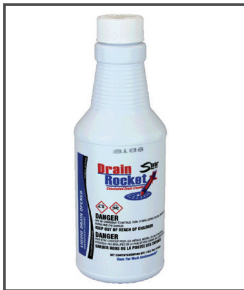
Drain Rocket™ Chlorinated Drain Opener