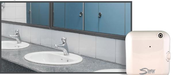
Small but mighty, State's Fragrance Cube 2-6 is a scenting solution for small, indoor spaces ranging from 2,000 to 6,000 cubic feet, like restrooms, offices and entryways.