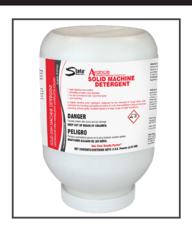
Avance™ Solid Machine Detergent Solid Machine Dishwashing Detergent