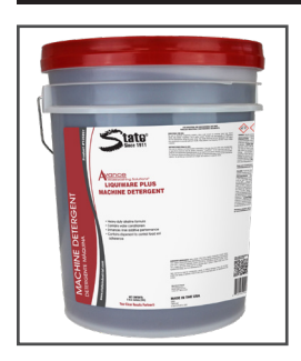
Avance™Liquiware Plus Machine Detergent Concentrated Warewashing Detergent