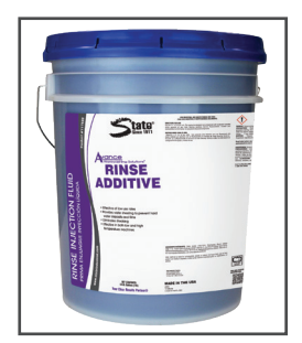
Avance™ Rinse Additive Rinse Injection Fluid