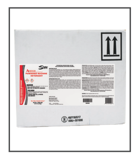
Avance<sup>™</sup> Powdered Machine Detergent Powdered Machine Dishwashing Detergent