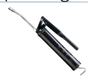
Battery Powered Grease Gun 117175