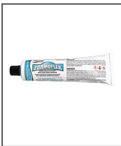
Formuflex® Clear Adhesive/Sealant with Ultra Violet Inhibitor